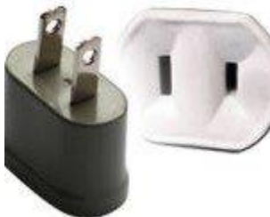
Type A: This socket has no alternative plugs

Type A and B plugs are used in Tokyo (JPN).