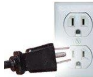
Type B: This socket also works with plug A