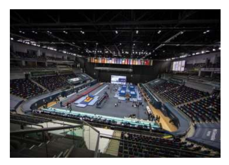
Training & warm-up hall