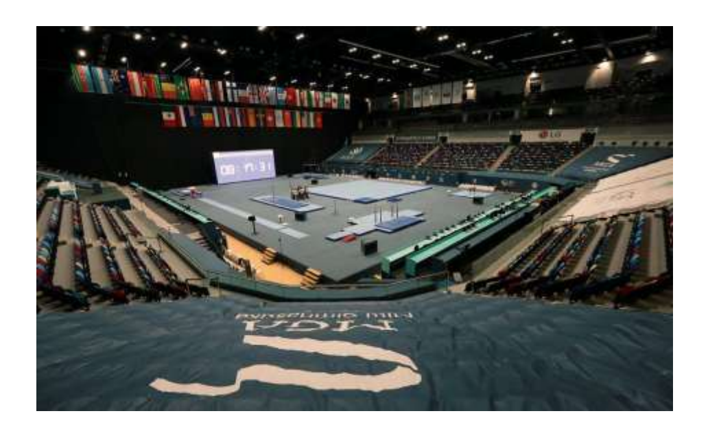
Warm UP / Training Hall