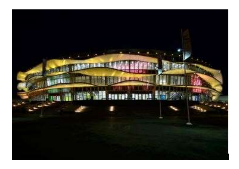
Field of Play