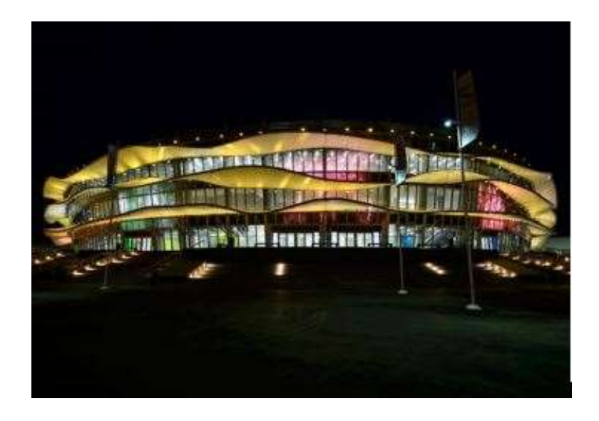
Field of Play