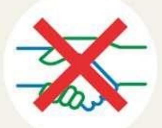
AVOID CLOSE CONTACT