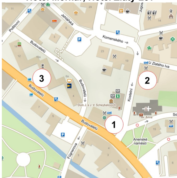
1-Hotel Merkur, 2-Hotel Zlatý Lev, 3-public bus stop Lázně