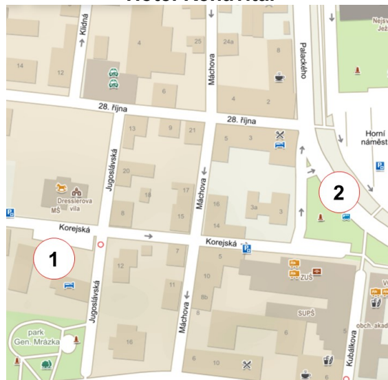
1-Hotel Rehavital temporary bus stop (to sports hall), 2-Horní náměstí (back)