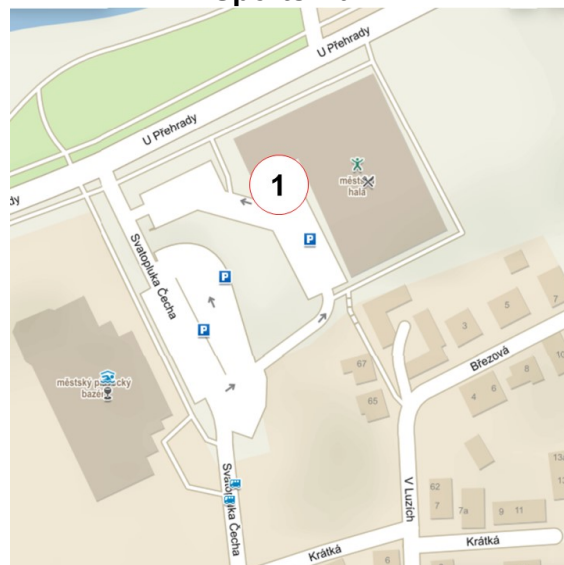
1-Sports Hall and temporary bus stop