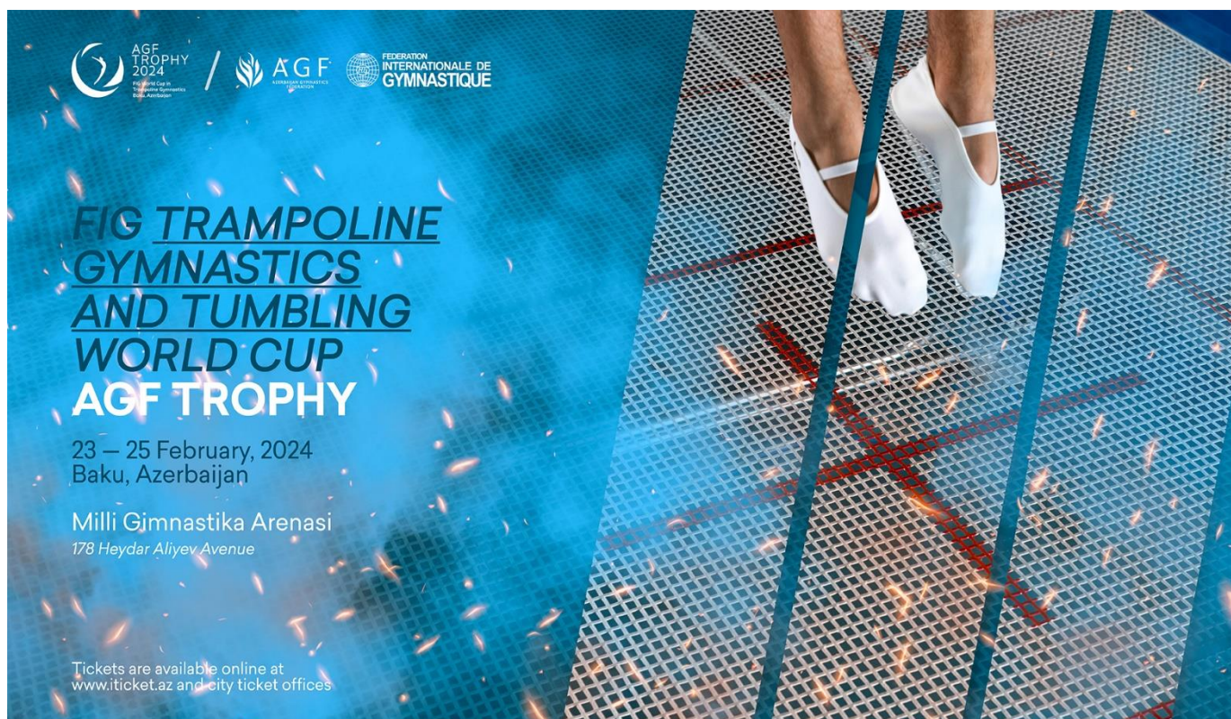
FIG TRAMPOLINE GYMNASTICS & TUMBLING WORLD CUP / AGF TROPHY