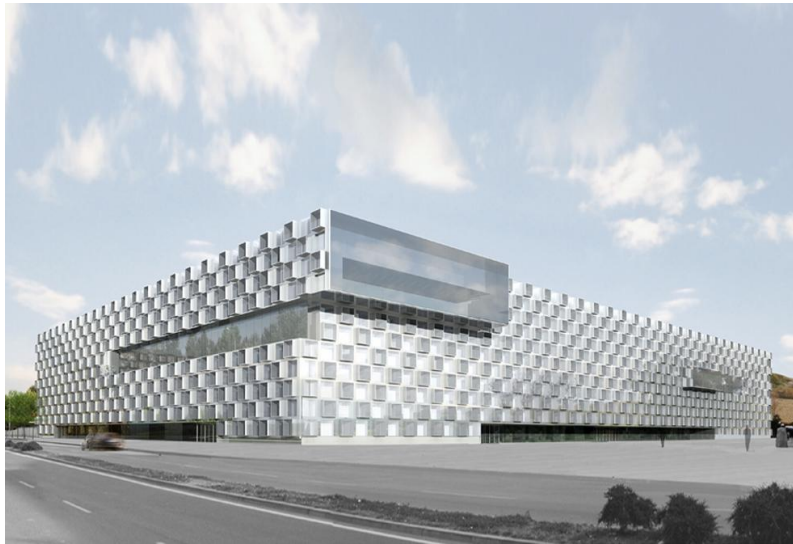
The Navarra Arena