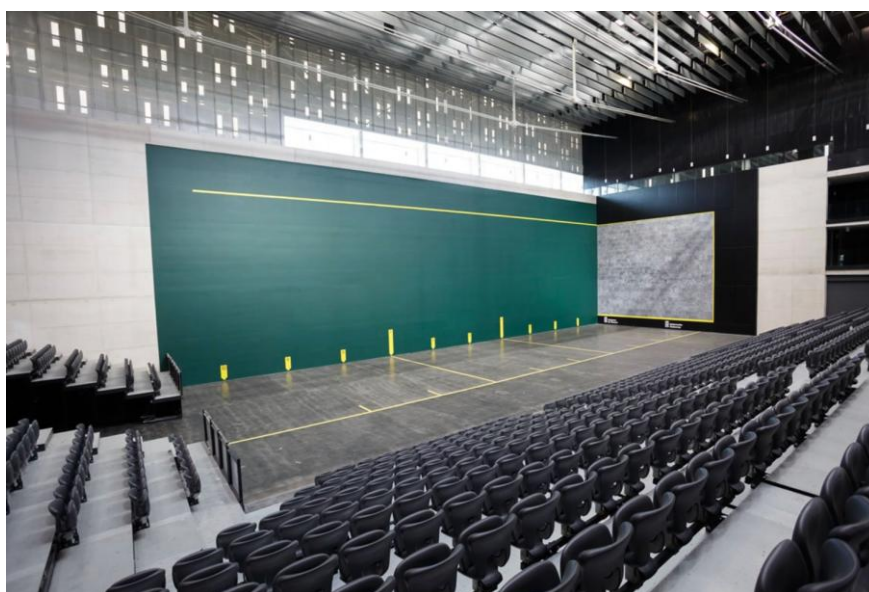
Training / Warm-Up Hall